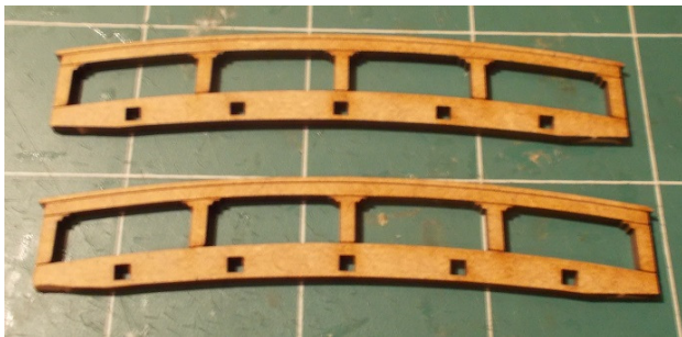
Remove two side pieces from the sprue.