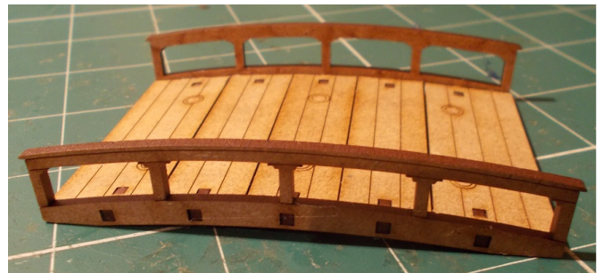
Glue them to the lugs on the floor pieces.