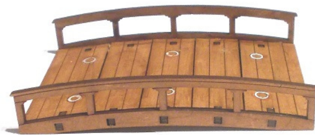
The finished bridge.

We used a wood stain and then carefully painted the circles with white paint.