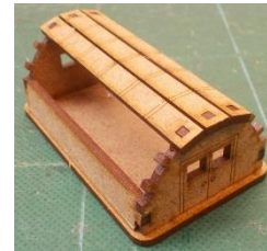
Starting with the three central ones, glue them into place. Then add the rest of the roof pieces.