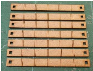
Take the roof pieces.