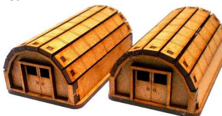
The completed buildings.