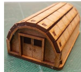
Glue them into place.