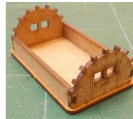
Then glue them into place as shown above.