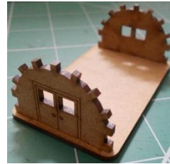
Glue the end pieces to the base – etched detail facing outwards.