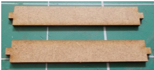
Take the two side pieces.