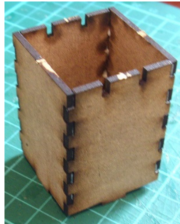
Glue the four walls together, ensuring that the notches are on opposite sides as shown above.