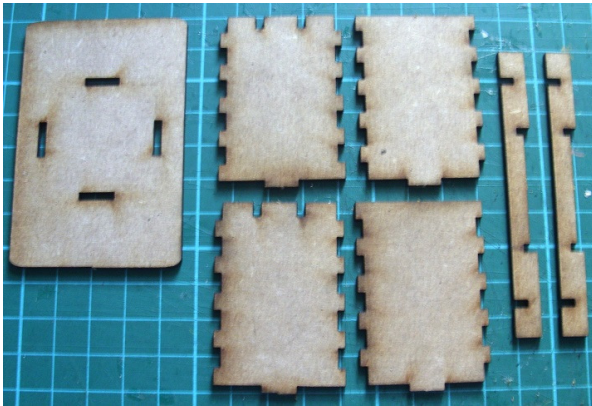
Start by removing the sections shown above from the sprue.

During the construction of this model, you may find it convenient to use pegs / elastic bands to hold pieces in place while you allow glue to dry.