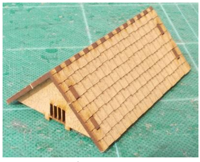
Glue the second roof piece into position, aligning it using the lugs/holes provided. We recommend you paint your roof at this point (see Painting tips below)