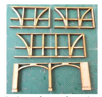
Take the lower frames from the sprue.