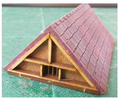
Add the roof frames at each end.