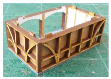
Starting with the archway, glue this into place so the left hand side aligns with the edge of the side wall. The right hand end will extend out by around 3mm. Glue the other frames into place.