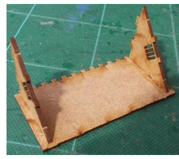
Glue the end supports to the back of one of the roof pieces (as seen above).