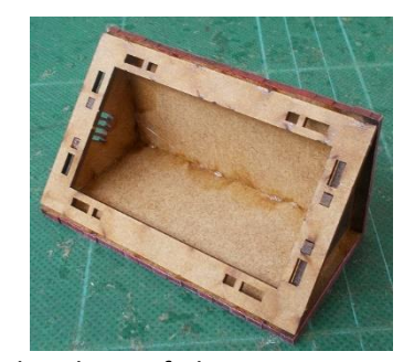
Glue the roof plate into position.