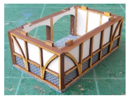
Glue the inserts into position. These are placed on the sprue in their relative positions for each wall.