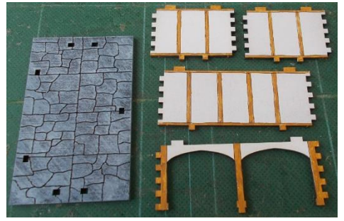
Remove the stone floor and lower walls from the sprue (as shown above)

You may find it easier to paint portions of this model BEFORE construction – please see the end of the document for info about this.