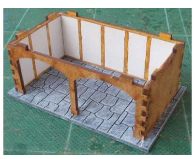
Glue the walls to the base with all the etched detail facing inwards.