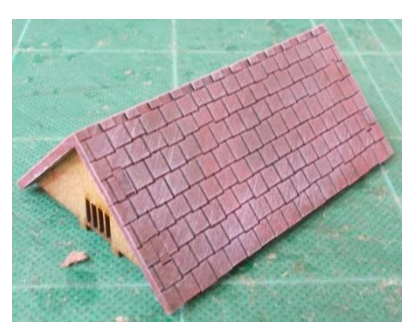
The roof once painted.