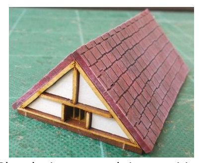
Glue the insert panels into position.