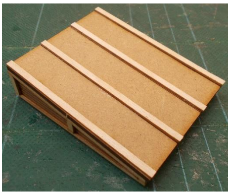
Attach the rood strips.