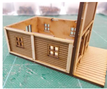
The add the side frames.