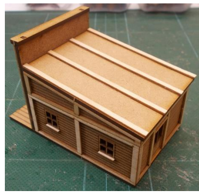
Place (do not glue) the roof onto the base of the model.