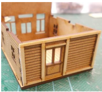
Add the rear framework