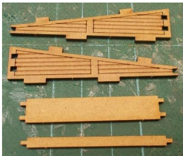
Take the frame components of the roof.