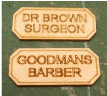
Choose which sign to use.