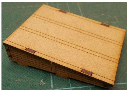
Then glue the roof plate into position.