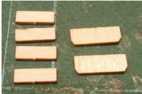
The window sills.