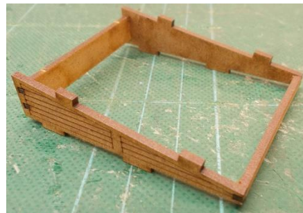
Glue them together as shown above.