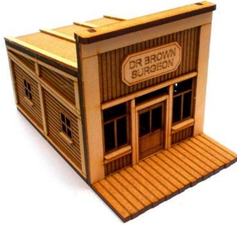
The finished model.