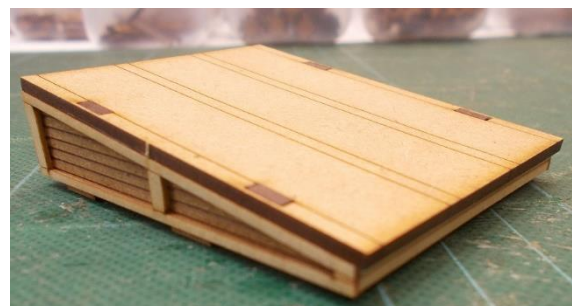
Add the side frames to the roof.