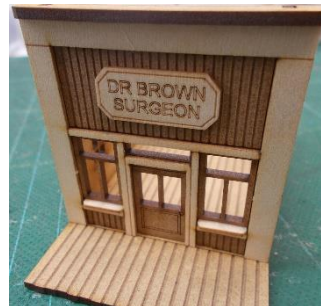
Glue this into position.