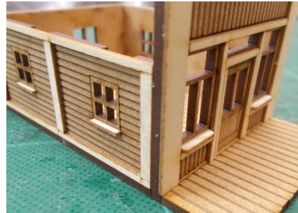
Glue these into place in the slots under each window.