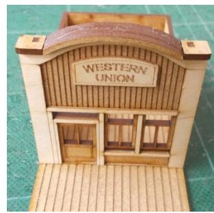
Add the curved portion of the top bar.