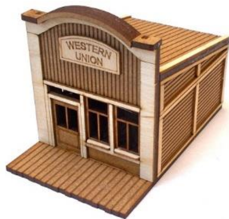
The completed model.