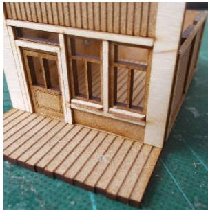
Glue these into place in the slots under each window.