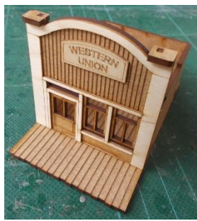
Attach the front framework to the model.