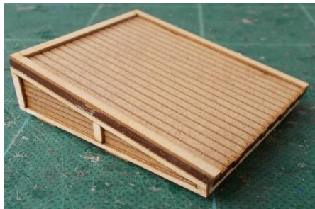
Add the side frames and top surround to the roof.