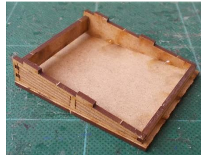
Then glue the roof plate into position.