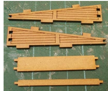
Take the frame components of the roof.