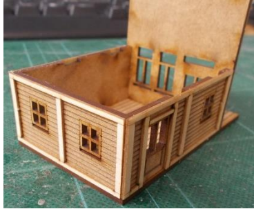
Add the rear and side frameworks.