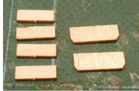
The window sills.