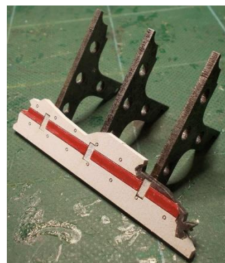
Glue the supports to the back of the "wall" using the lugs / holes provided.