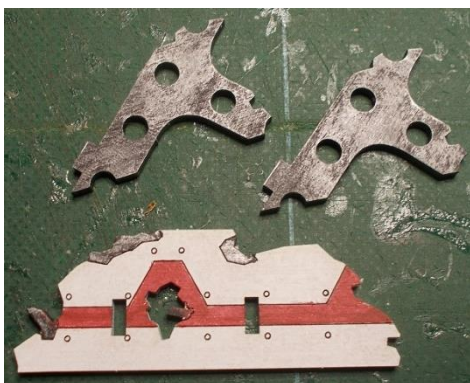
The pieces for barricade #1.

We painted the pieces of our model prior to assembly. See below for details.