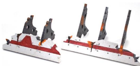
The completed barricades