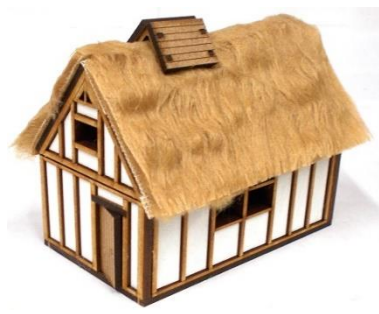
The finished model.