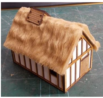
Glue the smoke hole cover to the roof.