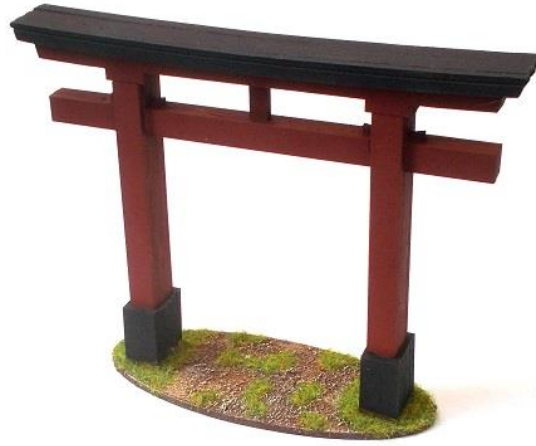
The completed model.

Glue the base sections into place on both sides of the prayer gate.