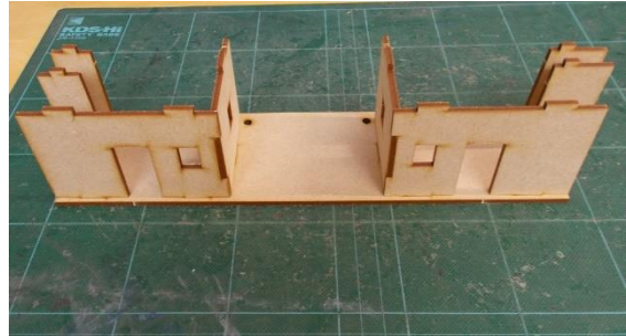
Attach them together as shown above.