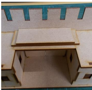
Add the two steps above the entrance.