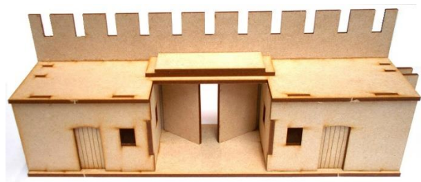
The finished model.