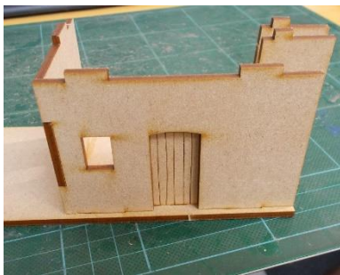
[Optional] Glue a door behind each doorway.