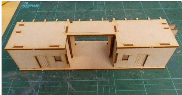
Glue the walkway into place, gently slotting each lug into the appropriate hole.