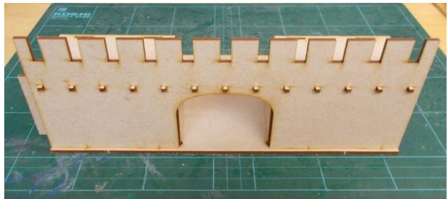
Add the front wall.