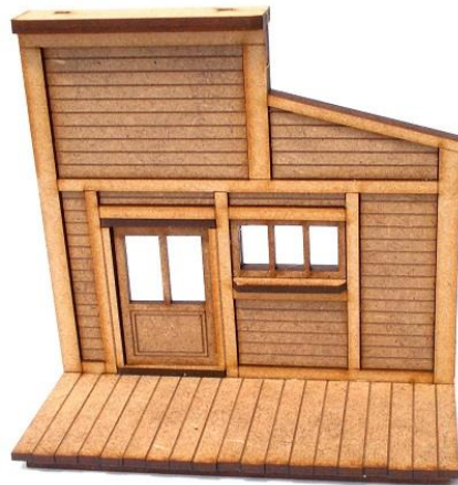
The completed front.