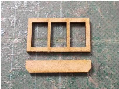
The window and sill.

Apply some glue to the upper support and then slide it completely into position.