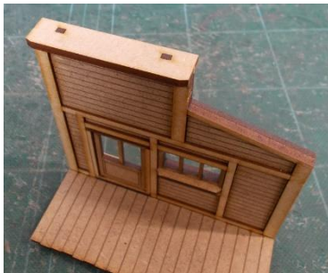
Glue the top bar into position.

Glue the sill into place at the bottom of the window gap, then glue the window into place.