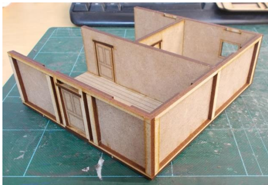
Glue them to the outside of the building as shown.