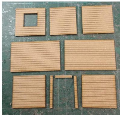
The insert pieces.