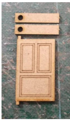
The outer door and its supports.