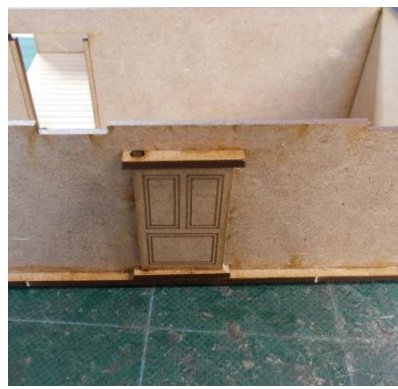
Slide the lower door support into the gap by the floor, then insert the lug of the door into it. Slip the support over the upper lug, then gently push it into the upper gap in the door frame.