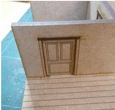
Repeat this for the inner doors (they only have separate upper supports)