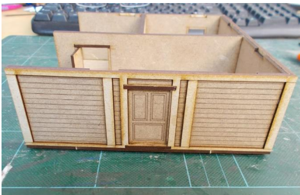
Glue them into the gaps within the frames.