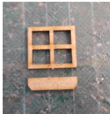
The window and sill.