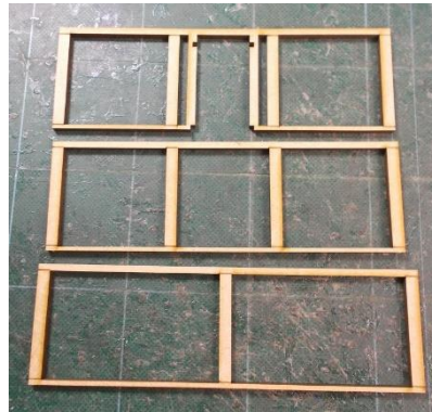
The outer frames.