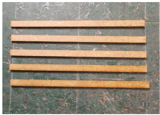
The roof strips.