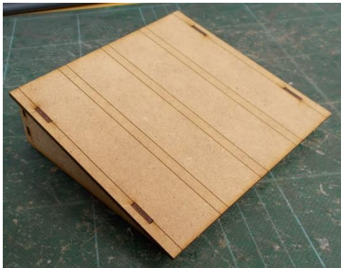
Glue the roof into place.

Note: The two cross bars have an arrow on them. These should both point towards the front of your building.