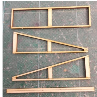
The end and side "frames"