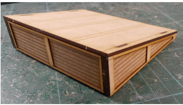
Glue these into the frames.