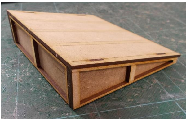
Glue the frames to the outside of the model as shown above.