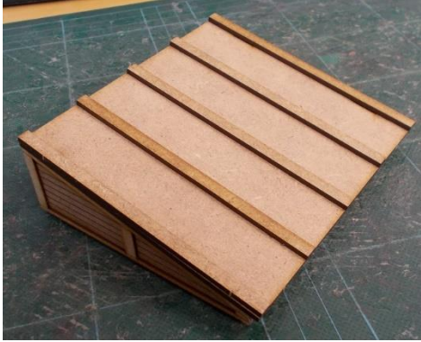
Glue the strips into place.