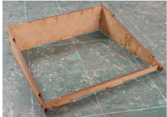
Glue the pieces together as shown above.

Note: The two cross bars have an arrow on them. These should both point towards the front of your building.