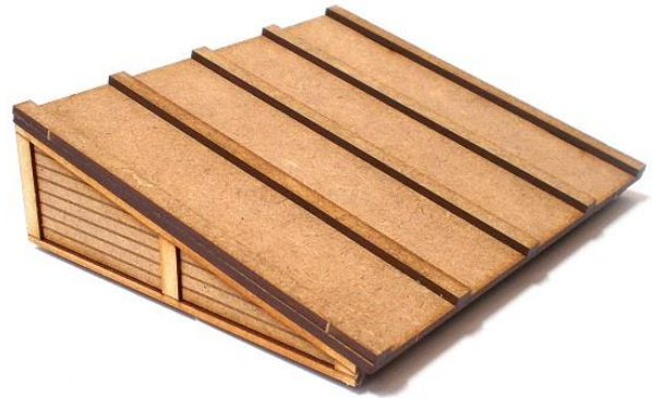
The completed roof.