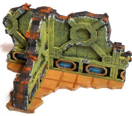
The completed model.