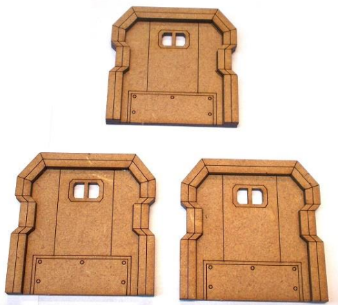
The completed doors