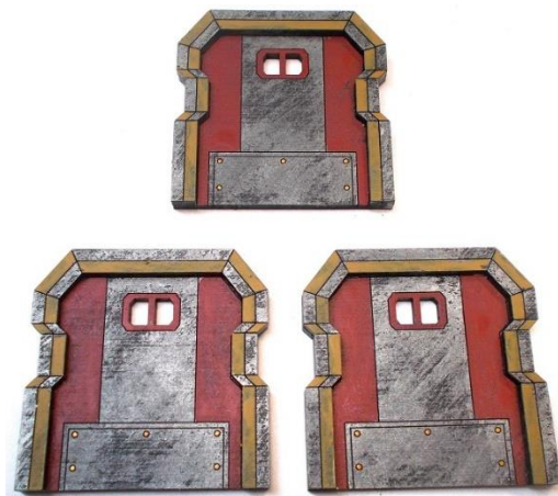
The doors once painted.