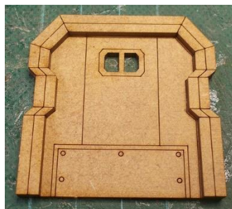
Stick the frame to the door.