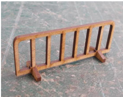
Then add the second foot.