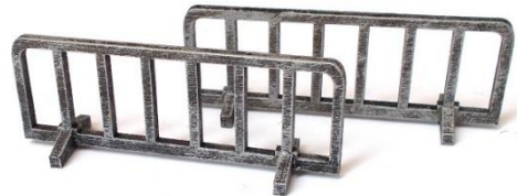
The finished barriers