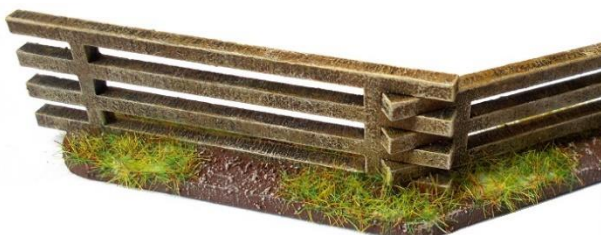
A completed fence