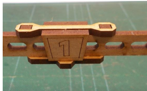
The numbered signs slot into place – one on each side of the gantry.