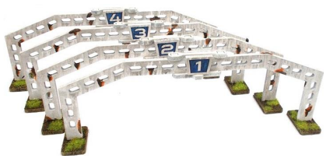
The gates once painted.