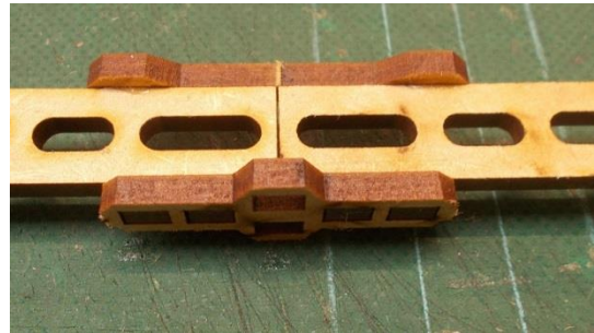
Glue the two connectors to the gantry.