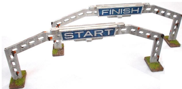
The gates once painted.

After construction we sprayed our racing gates white with a car undercoat aerosol spray. The background of the signs were then painted dark blue (model paint) and highlighted with a pale blue (model paint).