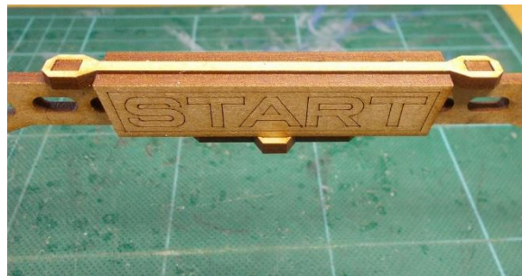
The signs slot into place – one on each side of the gantry.