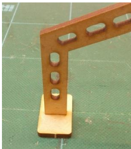
Add a foot at each end.