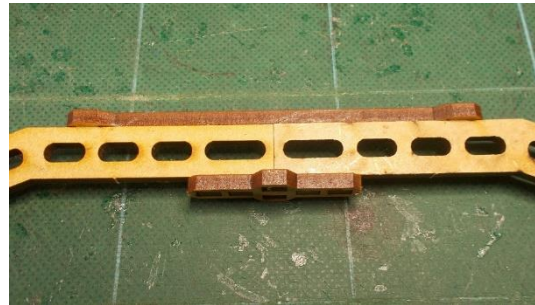
Glue the two connectors to the gantry.