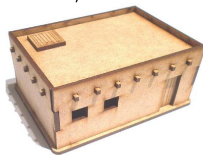
The finished building.