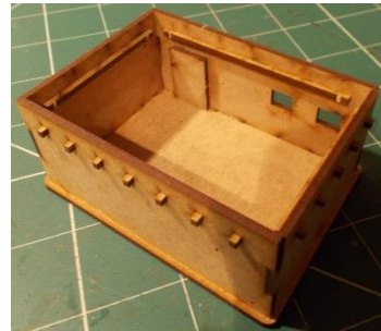
Glue the door behind the opening and attach the supports by pushing the lugs through the holes in the walls so that they stick out as shown above.