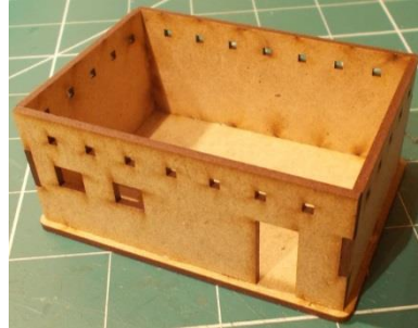
Glue the four walls together as shown above and attach them to the base.