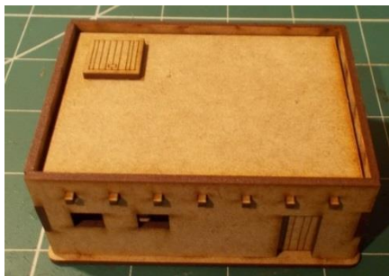
Glue the trapdoor to the roof and place (do not glue) the roof on top of the roof supports.