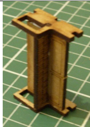
Start by attaching the keyboard to the front of the piano, then glue the ends in place.