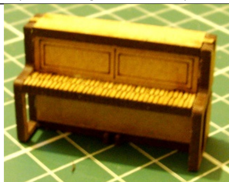
Finally attach the back.