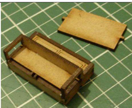
Attach the base and top of the piano.