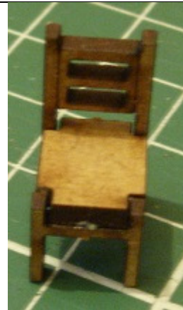
Apply glue to the underside of the other end of the seat and attach the front legs.