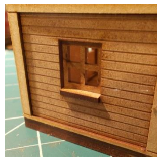
Glue a sill below each window.