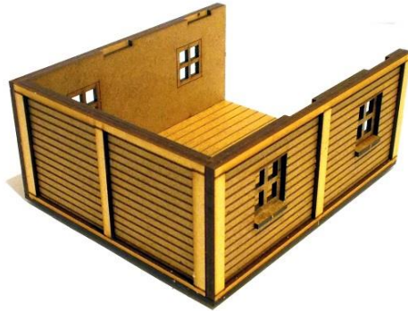
The completed upper section.