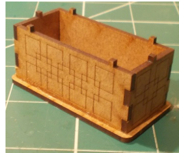
Glue the walls to the base as shown.