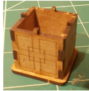
Glue the wall sections to the base piece.