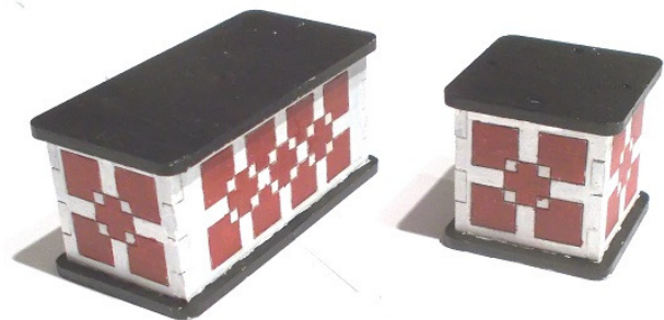
Examples of painted stands.