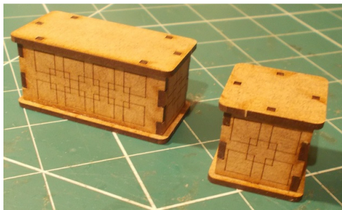
Glue the lids onto each stand.