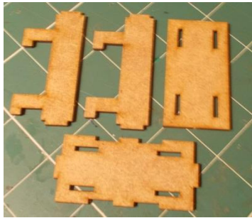
One end of the wall is formed from the pieces shown above.

During the construction of this model, you may find it convenient to use pegs / elastic bands to hold pieces in place while you allow glue to dry.