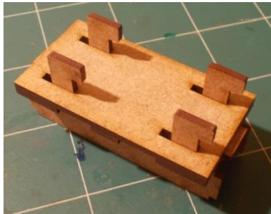
Add the outer layer.