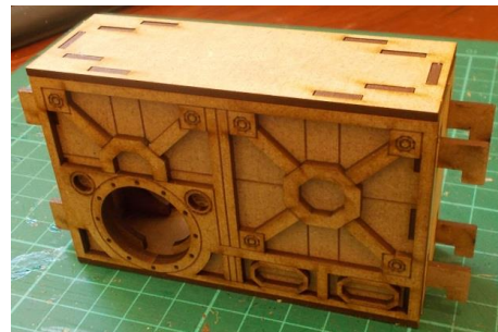
Glue the outer wall decoration and "lid" into place.