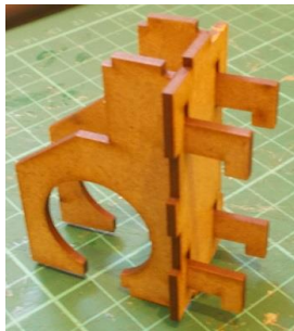
As with the first end piece, glue the two hooked pieces into place then add the outer layer.