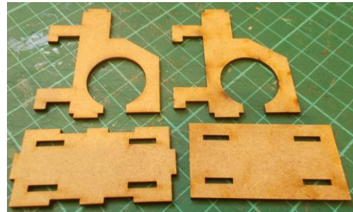
The other end uses these pieces.