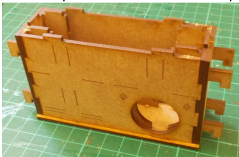
Add the side walls.