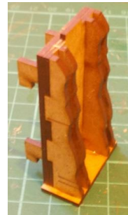
Add the side walls.