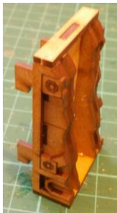
Then glue the "lid" into position.