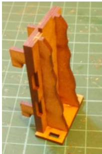
Glue the end to the base.