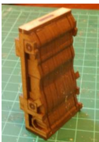
The completed wall section.