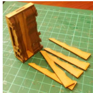
Take the contour sections and glue these into position.