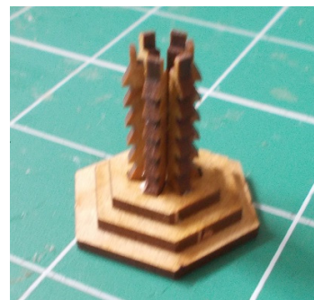
Glue the other rods into position.