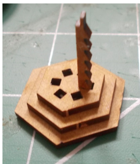
Glue the other bases into place to form a stack.