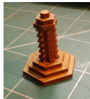
Finally attach the two smaller cap pieces.