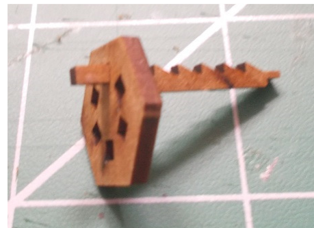
First insert one of the rods into the smallest of the hexagonal bases as shown.