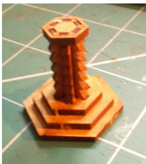
Starting with one rod, gently work your way around them slotting each in turn into the top.