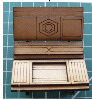
Glue these into position on the wall (NB: There are lines inscribed on the wall to help you position these). Leave to dry. Ensure the decorative pieces do not extend over the ends of the wall as this will make linking corridor sections together quite tricky.