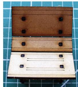
Apply a little glue to the supports and attach the pieces as shown above. Note the two lugs on each support should be at the bottom of the wall (i.e. the section with the four sets of horizontal lines marked on it. Leave to dry.