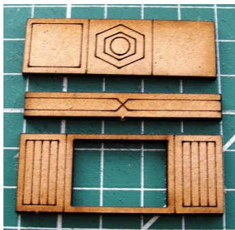
Once the wall is dry, remove the pieces shown above from the sprue.