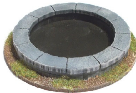
The finished Pit / Pool