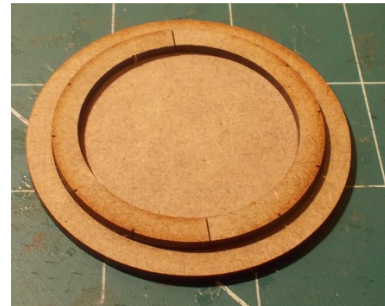
Glue two of the semi-circles to the base as shown, aligning them with the circle etched into the base.