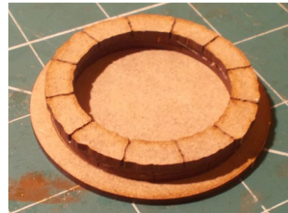
Glue the top ring into place so it slightly overhangs on all sides.